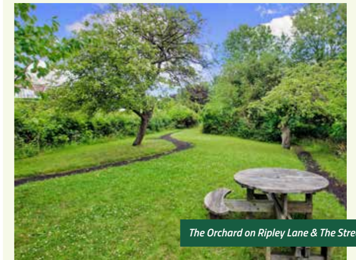
The Orchard on Ripley Lane & The Street