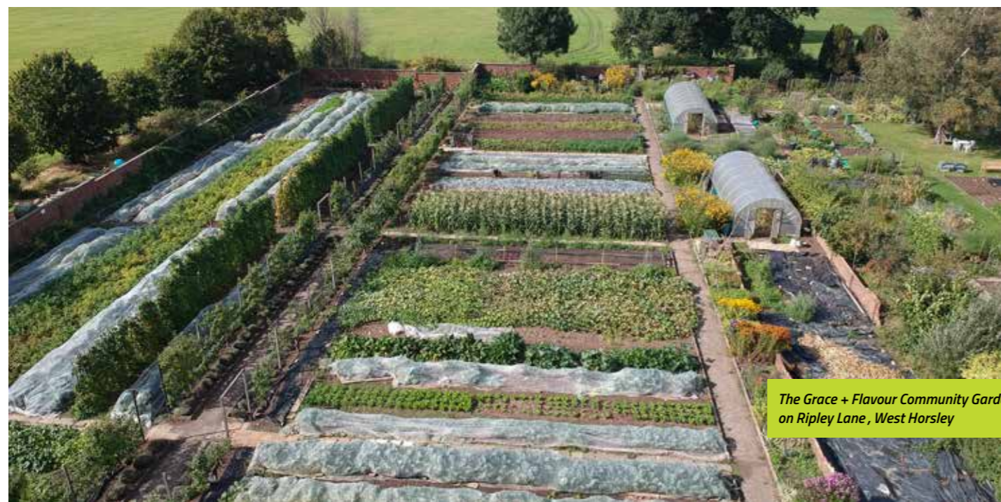
The Grace + Flavour Community Garden on Ripley Lane, West Horsley

The garden's successes cover a huge range of vegetables and fruit, from the standard cabbages, broccoli, runner beans, cucumbers, and carrots to Padron peppers, borlotti beans and Romanesco. However, the conditions this year have been ideal for the spread of blight and our potatoes and tomatoes have been badly hit.