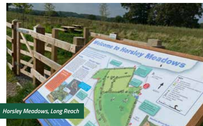
Horsley Meadows, Long Reach