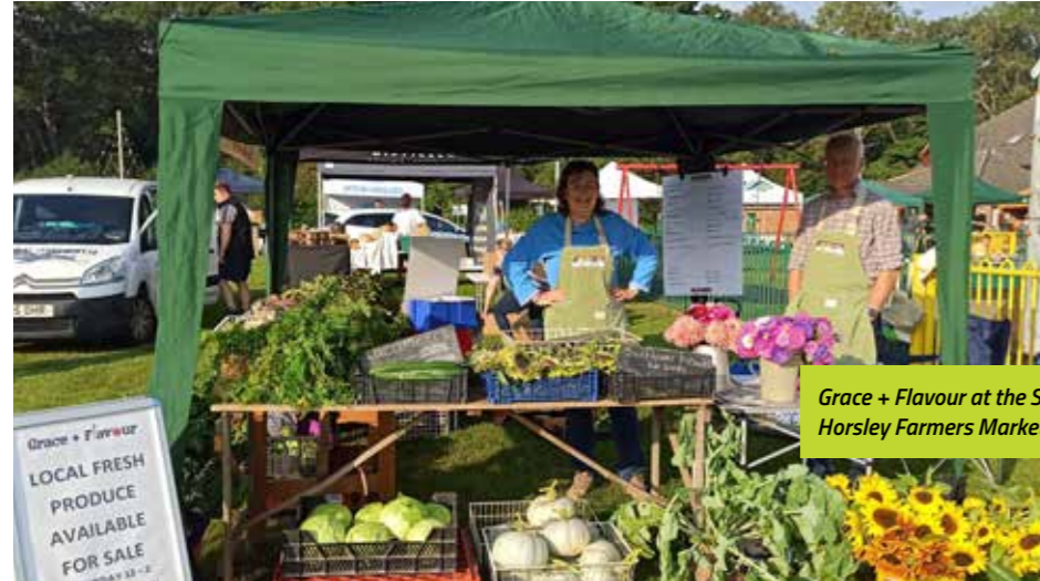
Grace + Flavour at the September Horsley Farmers Market

Grace & Flavour are a West Horsley in Bloom Non-Residential Silver-Gilt Award Winner