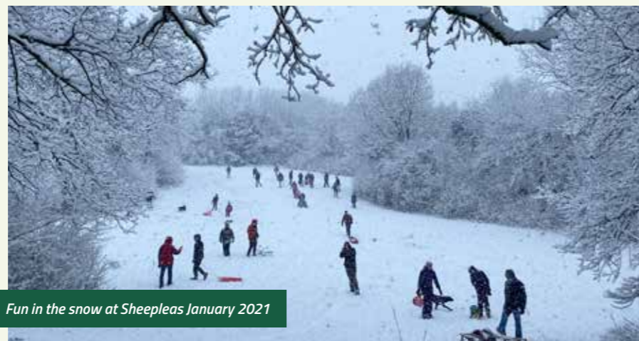
Fun in the snow at Sheepleas January 2021