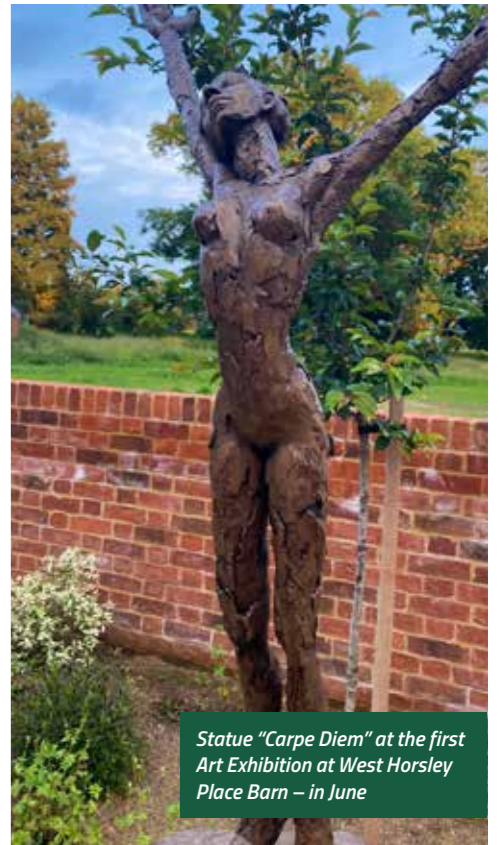
Statue "Carpe Diem" at the first Art Exhibition at West Horsley Place Barn – in June