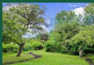
The environment and our trees and green spaces