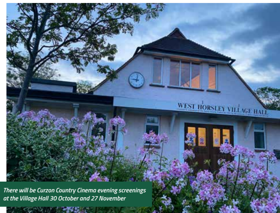
There will be Curzon Country Cinema evening screenings at the Village Hall 30 October and 27 November