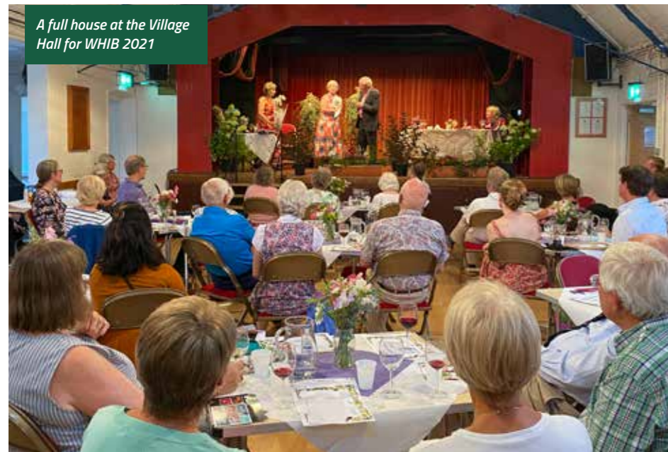
A full house at the Village Hall for WHIB 2021