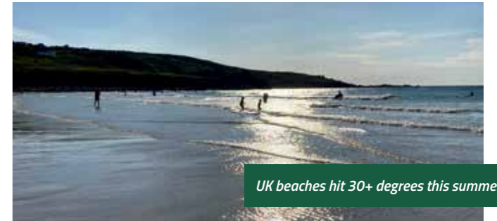
UK beaches hit 30+ degrees this summer