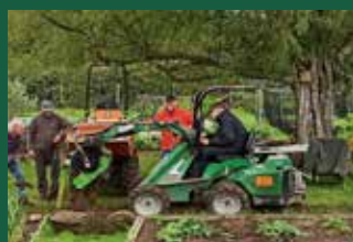
Volunteers at the Grace & Flavour Community Garden