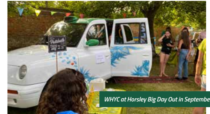
WHYC at Horsley Big Day Out in September

Vanessa Buosi – cllrbuosi@westhorsley.info .