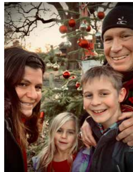
Residents taking selfies in front of the Village Green Christmas Tree which will be up again this year too.

Winners are listed on our website at www.westhorsley.info and will be featured in our Spring Newsletter.