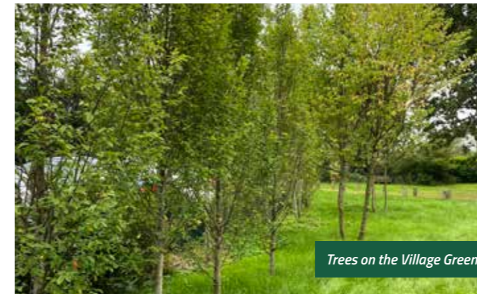
Trees on the Village Green

This resulted in Rowan trees being planted and the legacy was used to pay for those throughout West Horsley. Horsley Meadows (on Long Reach) should now be open for everyone to enjoy and the car park is surrounded by further planting which should mature well. It will be managed by Surrey Wildlife Trust on behalf of the Land Trust. The WHPC hope to be involved with this together with HCPS.