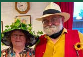
West Horsley in Bloom 2021 award presentation