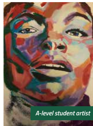
A-level student artist