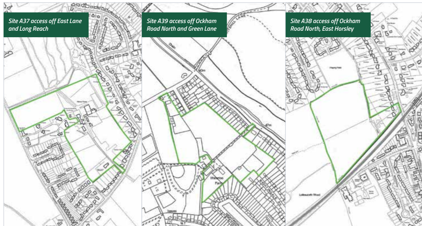
Site A37 access off East Lane and Long Reach